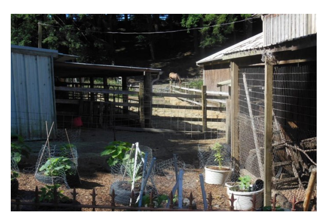
Main Barn, adjacent drainage (facing south). AFTER: Culvert has been installed so that there is no longer any above-ground flow through the stable yard; tree removed and vegetable garden planted (7-3-2018).