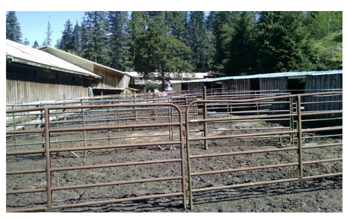
Paddocks between barn and stables. BEFORE: Highly concen-