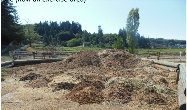
FINAL site visit, August 2018. New location of winter-storage manure pile, on a hardened gravel surface overlaid with rubber stall mats, and with telephone pole curbs to further prevent any runoff in direction of stream.