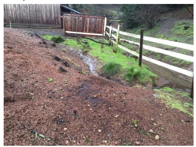
Initial site visit, December 2015 shows highly concentrated manure- runoff flowing directly into the tributary