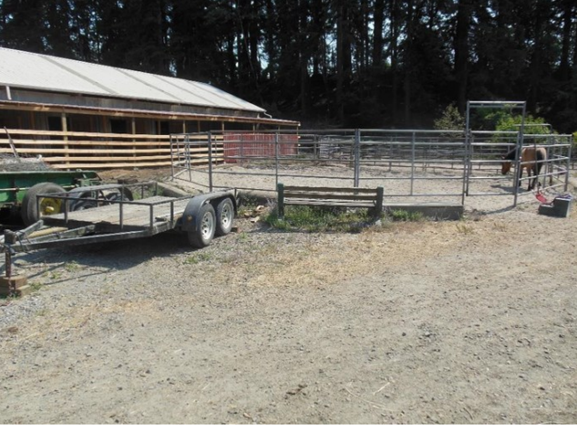
Final site visit, August 2018. Original location of manure nile (now an exercise area)