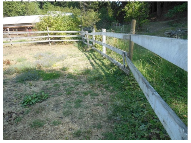
FINAL site visit, August 8<sup>th</sup> 2018 shows improved condition of the corral area; the pile has been relocated; gutters and roofing have been constructed on the west side of the barn to prevent runoff from the stalls on that side. A vegetative buffer has been established along the tributary stream.