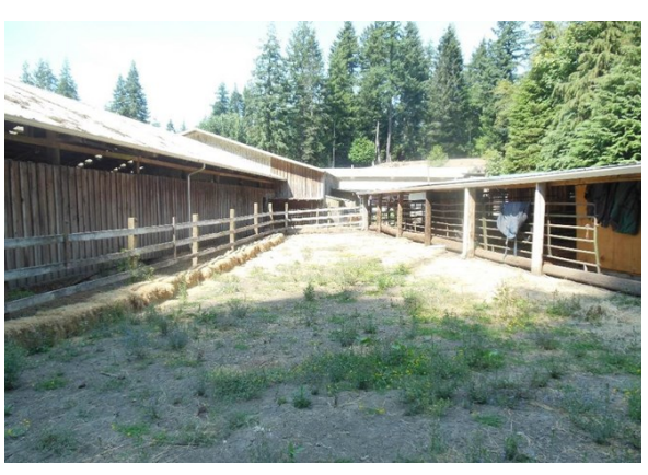
Paddocks between barn and stables. AFTER: Paddocks have been reduced and covered with roofing. Sparsely grassed area in the center is to be used as a buffer. Vegetation has been slow to grow due to