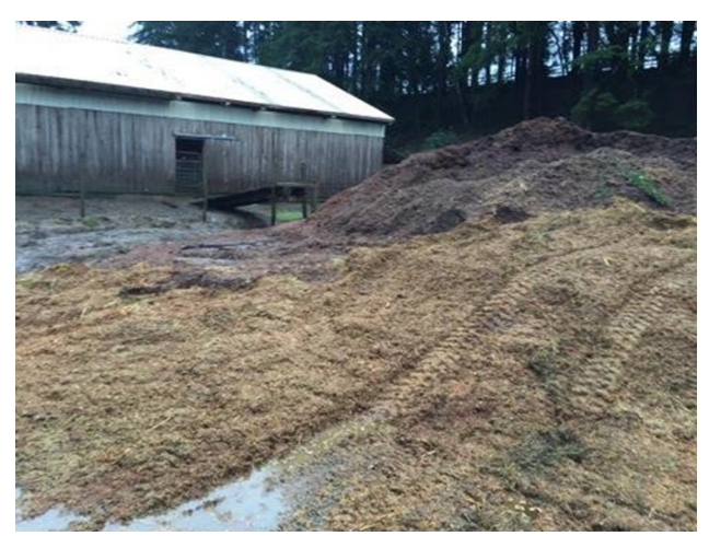
Initial site visit, December 2015. Original location of ma-