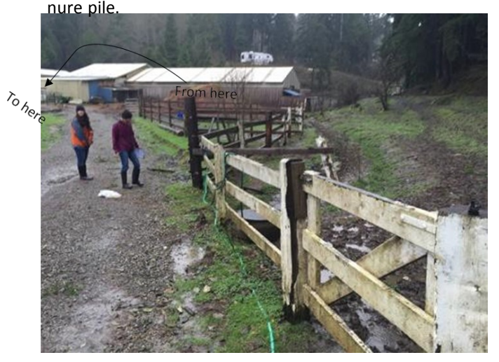
Initial site visit, December 2015. Original location of manure pile.