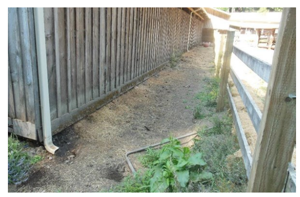
Main Barn, adjacent drainage: AFTER (8-8-2018)