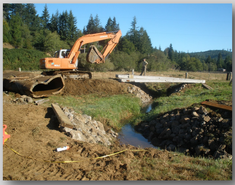
Work completed by Messerle & Sons.

The project proposal was to remove the six foot culvert in the driveway and the forty-two inch culvert in the field, which was no longer functioning and replace them with two concrete bridges. Each bridge would consist of two 29'4" x 5'7" x 12" reinforced pre-stressed concrete slabs, bolted and grouted together, with a guard rails on the driveway bridge and a stock fence on the field bridge. Considering the well compacted driveway, the firm creek bank, the expected traffic, loading, and the more than adequate length of the bridges to span the creek width, we will support the bridges on treated 4"x12"x12" treated timbers, to ensure alignment, and pull the creek banks to a 1:1 slope armored with 18" minus rip-rap. We have calculated approximately thirty yards of rip-rap for the creek bank armoring and twenty yards of rock for the driving surface approaches. The field bridge will be raised approximately 18" above the field level, on a well compacted soil pad, to allow for high water flows during storm events to diffuse onto the pastureland downstream from the bridge structures. Disposal of the metal culverts, finish grading, cleanup, and affected fence restoration are included in the bid. A farm plan will be drafted for the landowner by the Coos SWCD to address streamside erosion and fencing to exclude livestock.