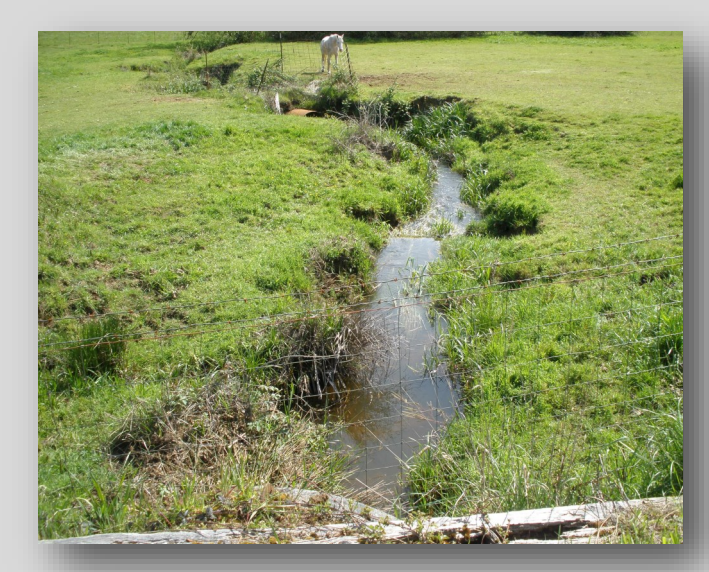
Before Photo: April 2009