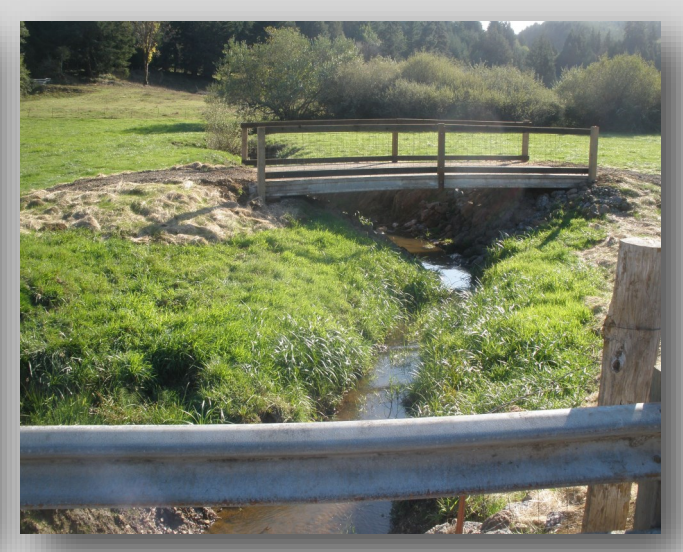
After Photo: October 2011