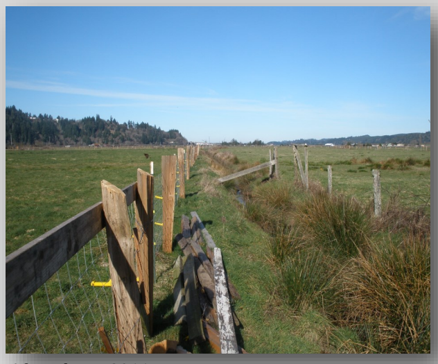
After Photo: 2011

This project addressed water quality concerns in riparian process and function. This year all the fencing was completed on this project. About one mile of fencing was completed on the landowner's creeks and ditches. One side of the creek has a permanent fence with woven wire and two strains of hot wire and the other side has an electric fence that can be moved easily to allow the landowner to clean his ditches.