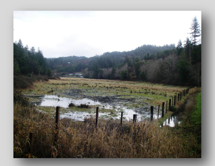
Before Photos: winter 2009 (Blackberries but no riparian trees or shrubs)