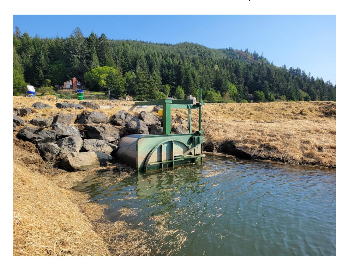
Requested by: Coos Soil and Water Conservation District 379 N. Adams Street Coquille, OR 97423